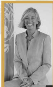
Stefania Giannini Assistant Director-General for Education, UNESCO