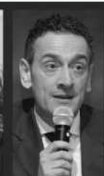
Piero Venturi European Union Delegation to African Union